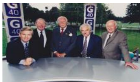
Steve Rider and fellow Grandstand presenters.

Steve, a local resident, appears at the Kenton Lectures on behalf of local charities.